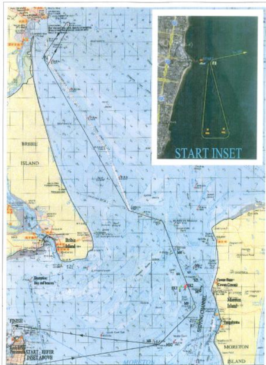
FAIRWAY CHALLENGE COURSE DIAGRAM

The course diagram is for general reference only and must not be used for navigation. Each participant must have a current MSQ recognized chart of the race area for navigation purposes. An A3 version of the course diagram is available from the MBYC web site www.mbyc.com.au .